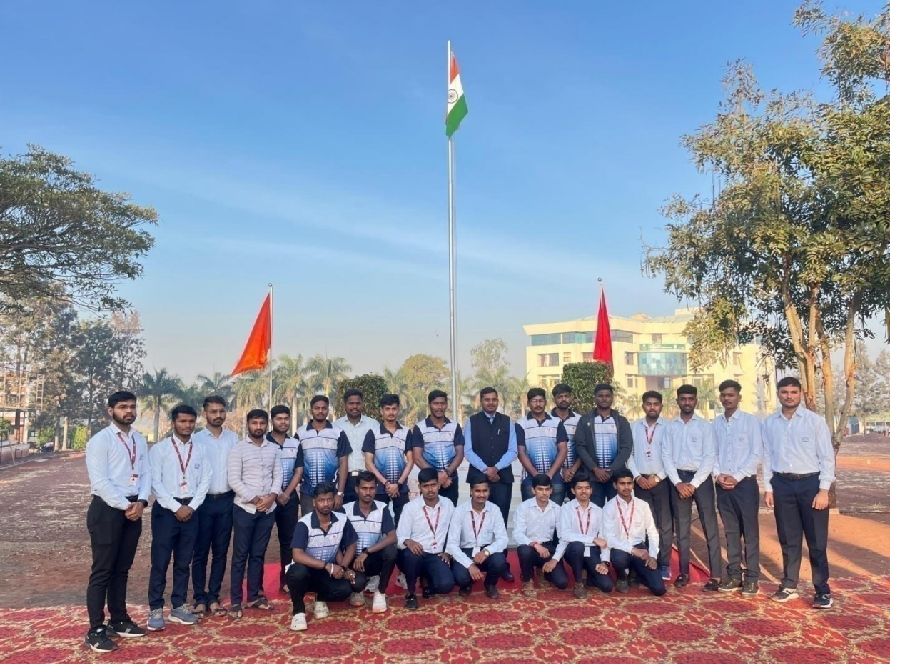
Celebration of “Republic Day”