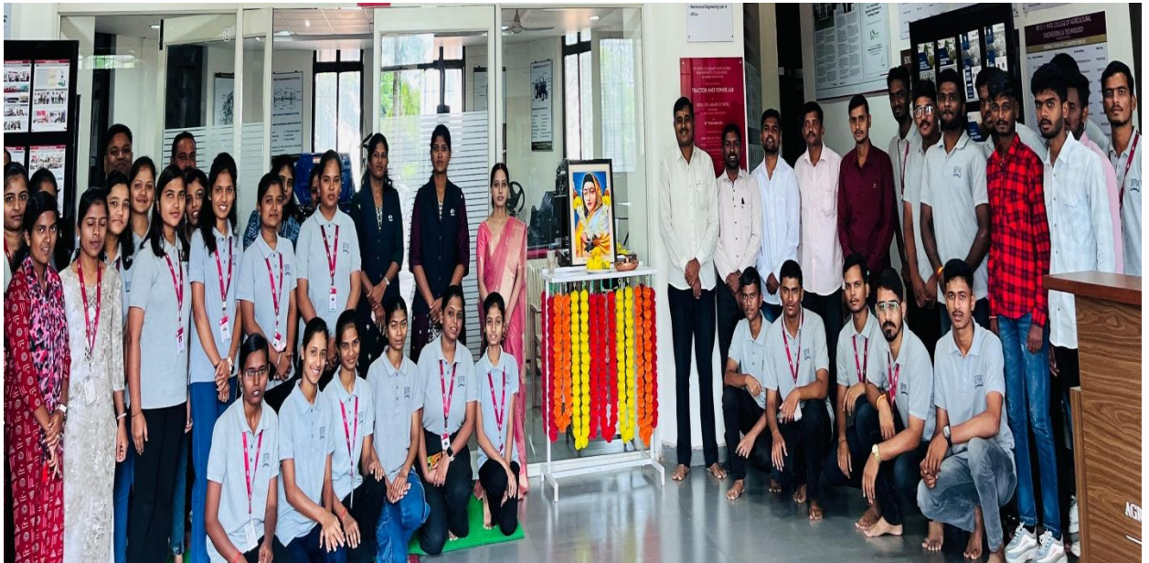
Faculty & Students of DYP CAET, Talsande celebrating Ahilyabai Holkar Jayanti.