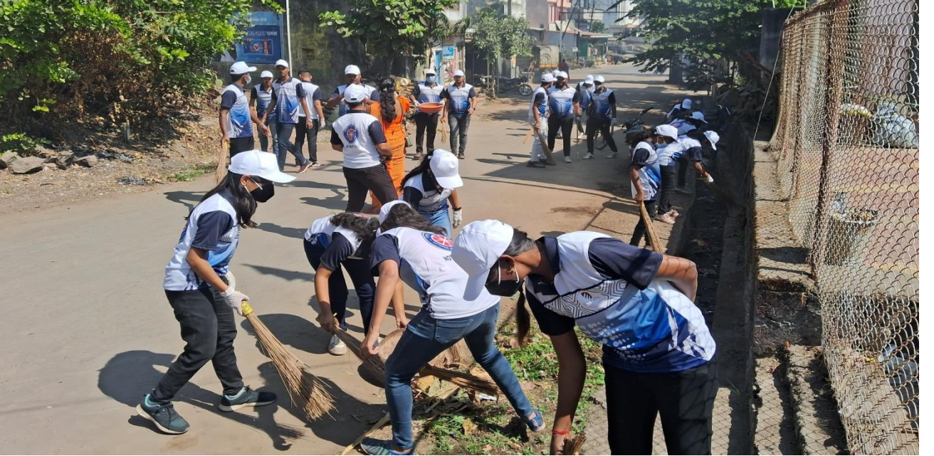
Cleaning of Public Places in village