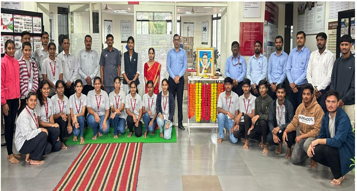
Faculty & Students of DYP CAET, Talsande celebrating Swatantryaveer Sawarkar Jayanti by Greeting the Image.