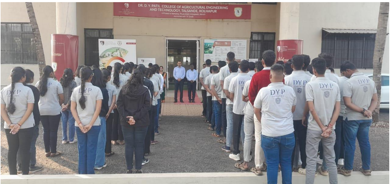
Students & Faculty celebrated Constitution Day by taking Oath of equality.