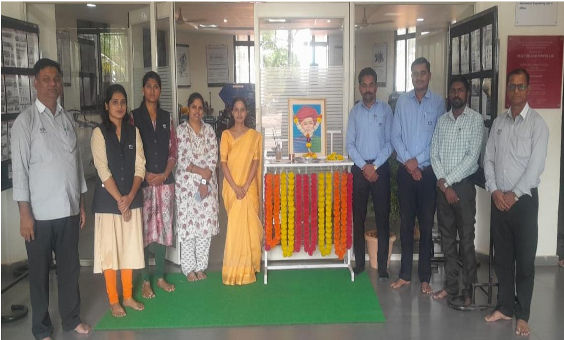
Faculty & Staff of DYP CAET, Talsande celebrating Mahatma Jyotiba Phule by Greeting the Image.