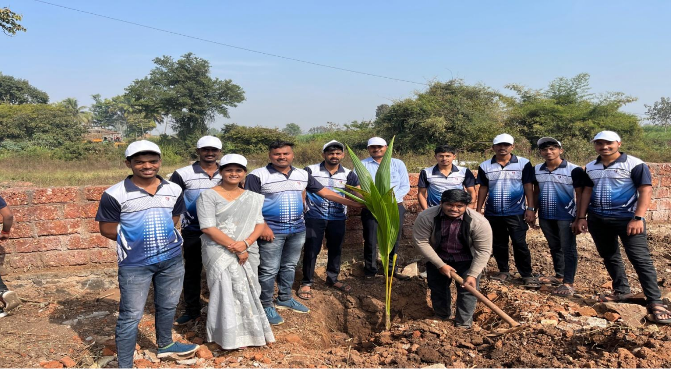
“ Tree Plantation Drive”