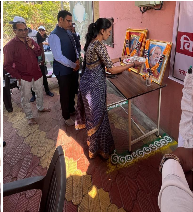
Inauguration of Camp by Sarpanch, Gramsevak, Local members of Mauje Padali, Principal, Academic In Charge , TPO, NSS Program Officer and NSS Volunteers