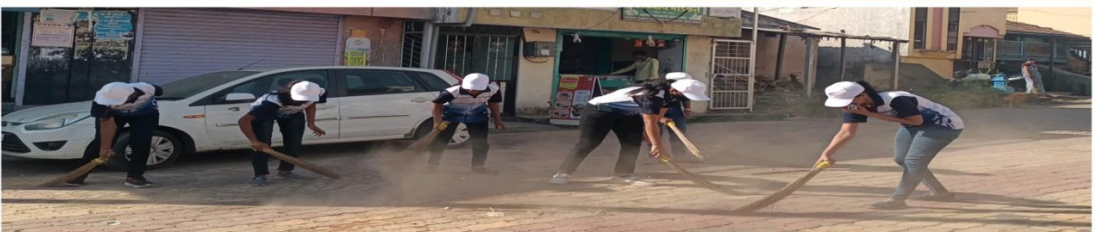
Cleaning of Public Places in village