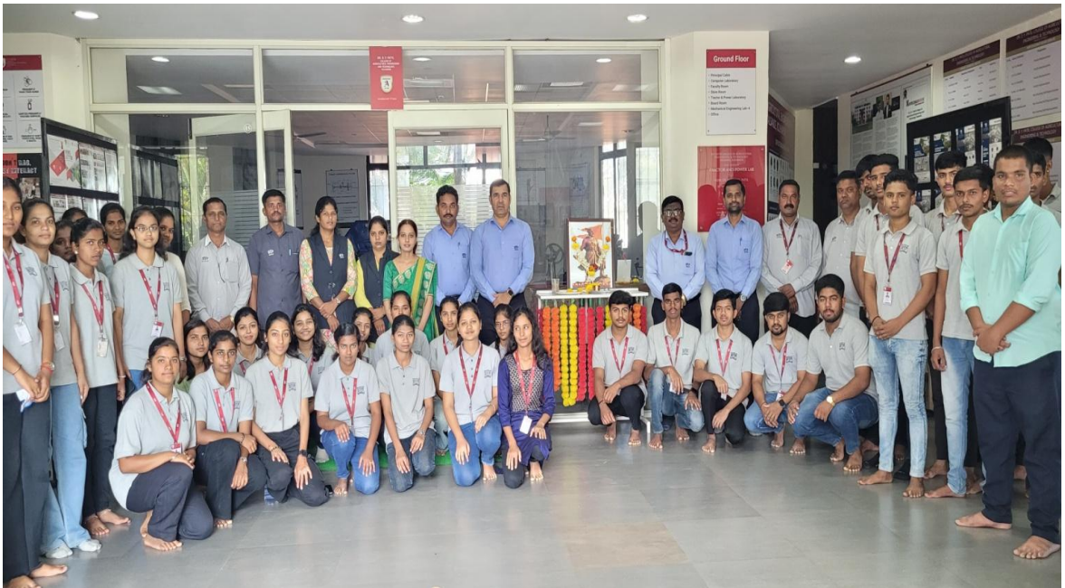
Faculty & Students of DYP CAET, Talsande celebrating Chhtrapati Sambhaji Maharaj Jayanti by Greeting the Image .