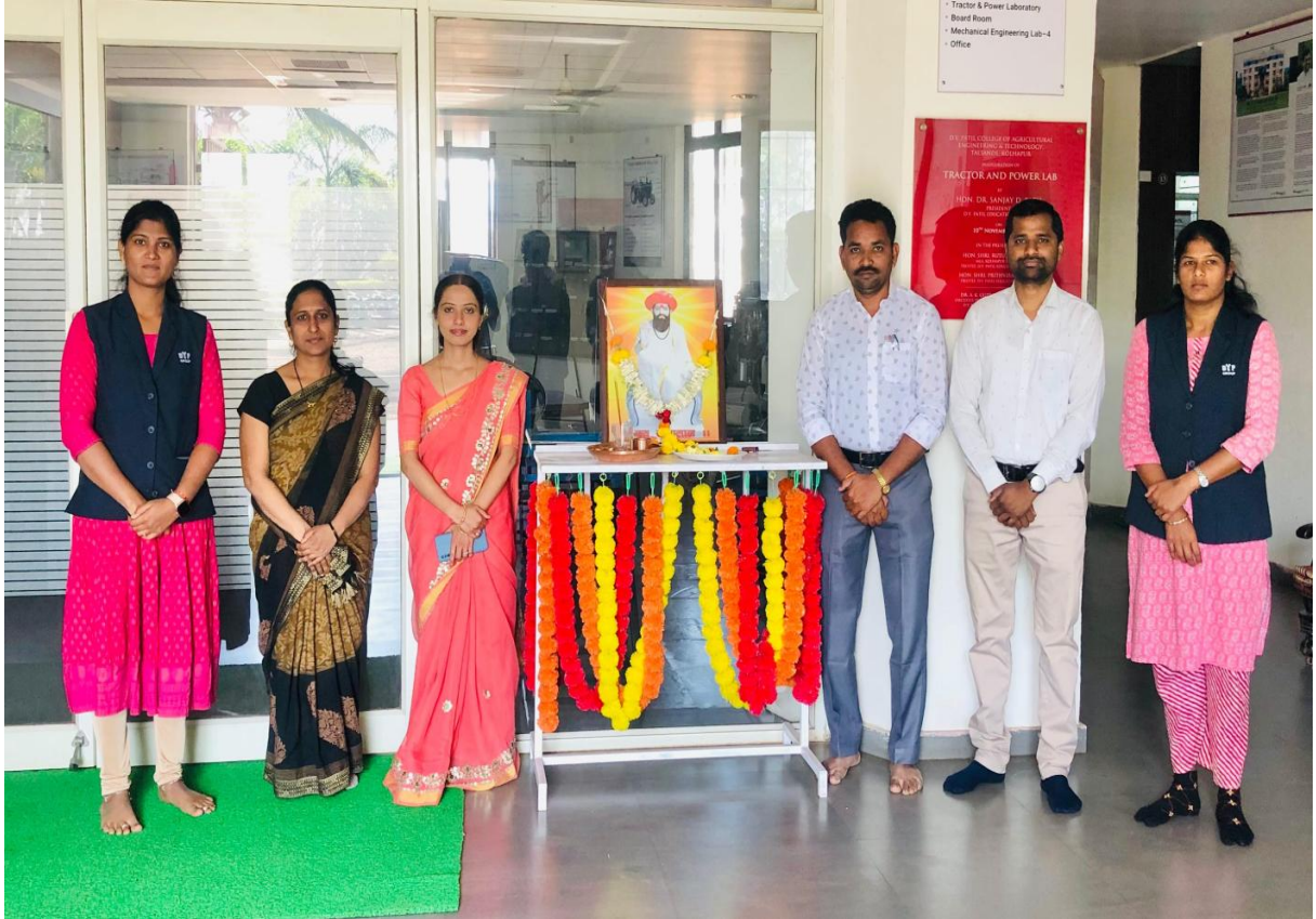
Teaching staff was Celebrated of Sant Ravidas Maharaj Jayanti