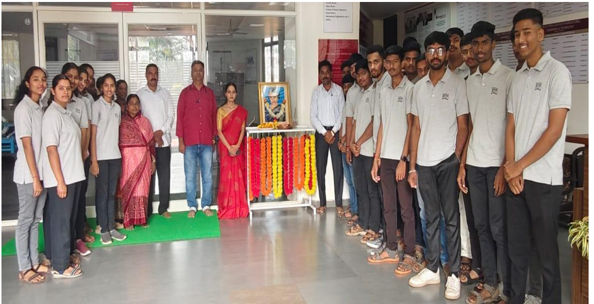
Students & Faculty of DYP CAET, Talsande showed their gratitude towards Indira Gandhi by greeting the image.