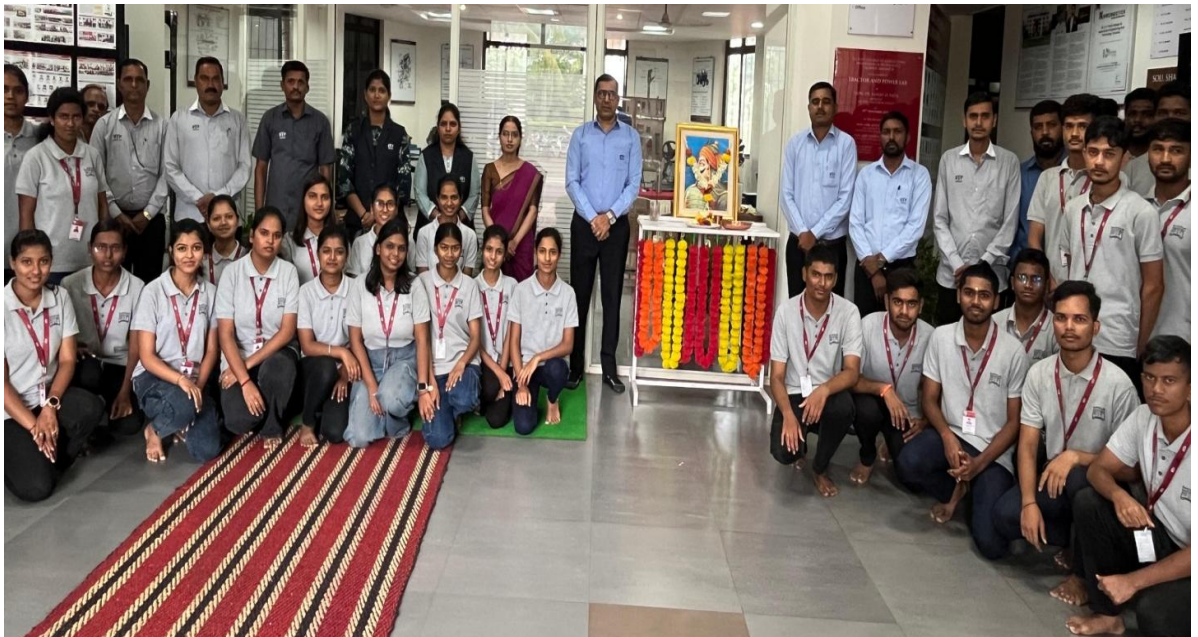
Faculty & Students of DYP CAET, Talsande celebrating Maharana Pratapsinha Jayanti by Greeting the Image.