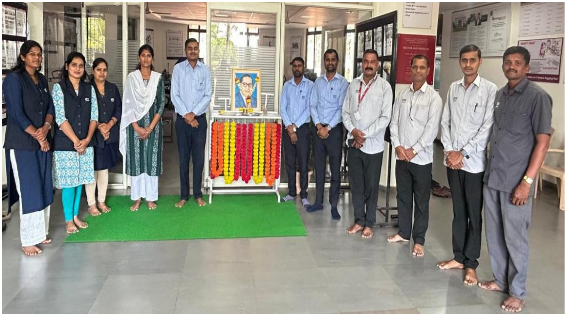
Faculty members greeting the image of Dr. Babasaheb Aambedkar on occasion