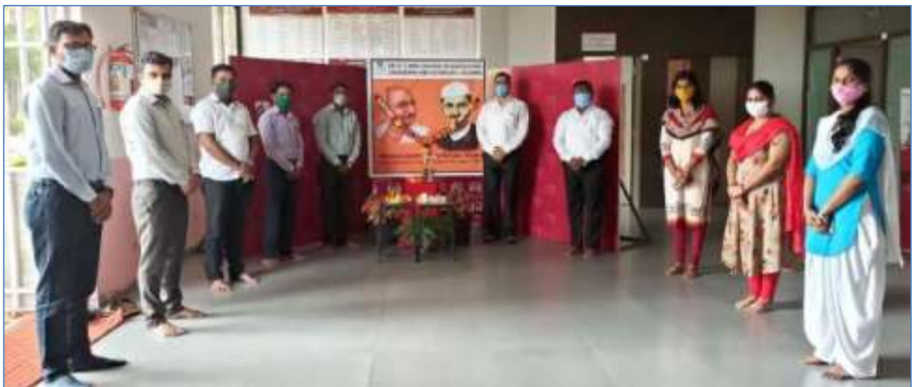
Faculty of DYP CAET, Talsande showed their gratitude by greeting the image of Mahatma Gandhi & Lal Bahadur Shastri on the occasion