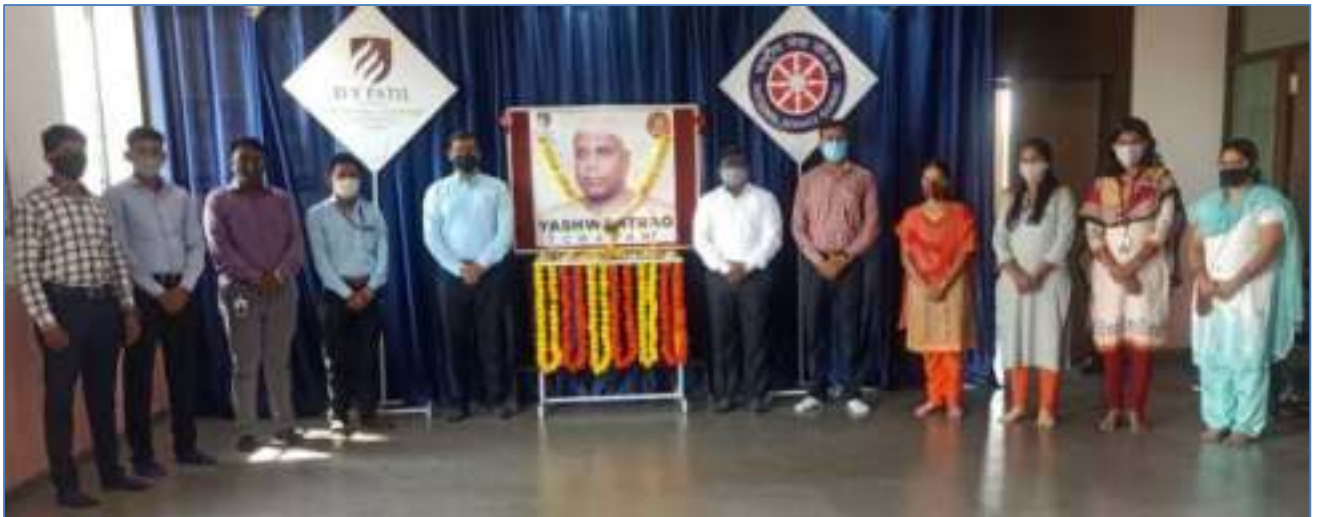
Faculty & Staff of DYP CAET, Talsande celebrating birth anniversary of Shri. Yashvantravji Chavan