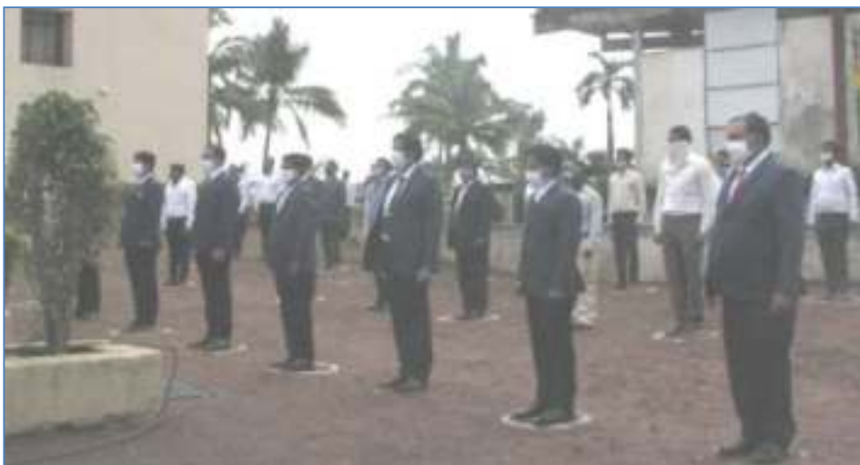
Faculty & staff of D. Y. Patil Agri. Campus attending flag hoisting by maintaining the Social Distancing