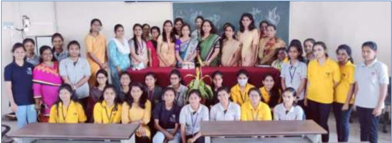
Girls Students along with ladies faculty celebrated a International Women's Day by cutting a cake.