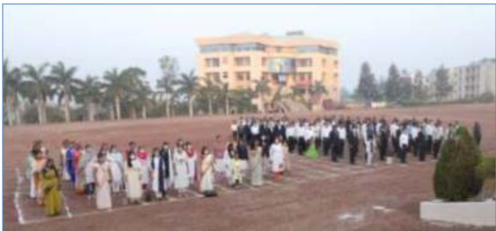
Students, faculty & staff present for ceremony