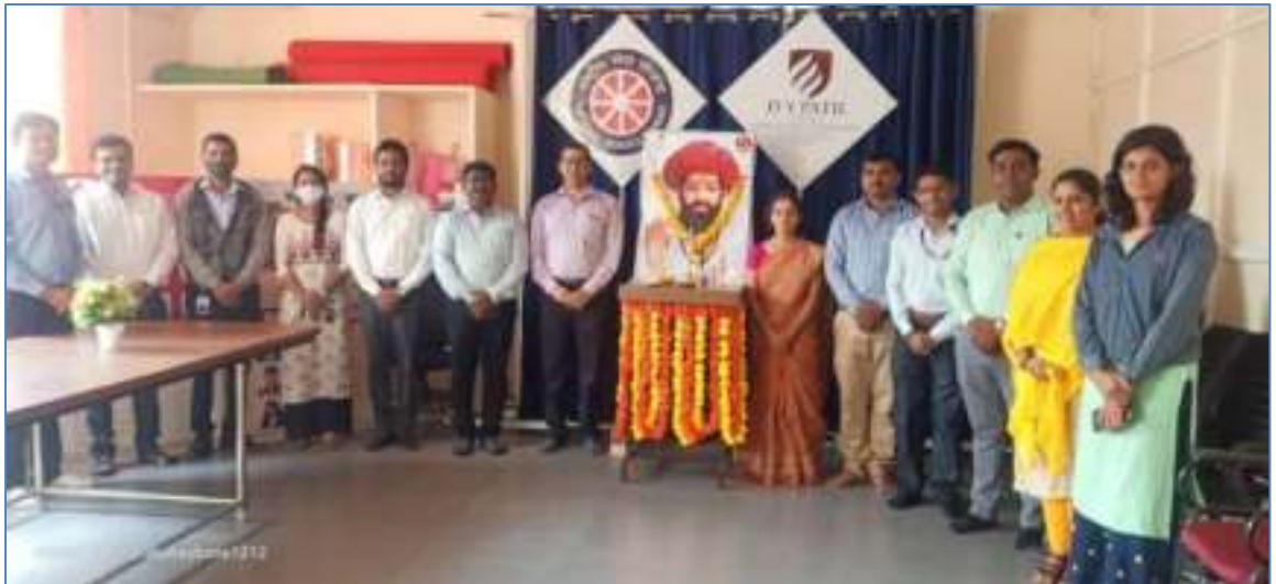
faculty on the occasion of Celebration of Sant Sevalal Maharaj Jayanti