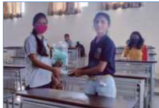
A mask distributed on the occasion of International Women's Day by of NSS Unit to all the ladies faculty, Staff & Girls Students present for the celebration.