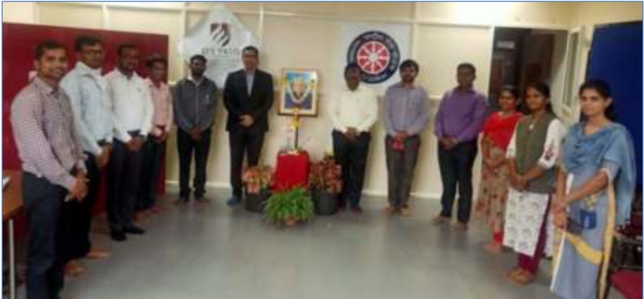
Principal, Academic In Charge, NSS Program Officer & Faculty of DYP CAET, Talsande on the occasion of A. P. J. Abdul Kalam Jayanti.