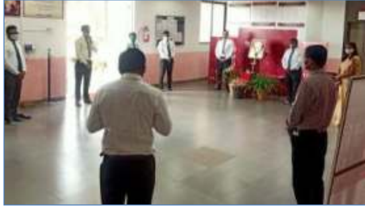
Faculty present for the Engineers day program