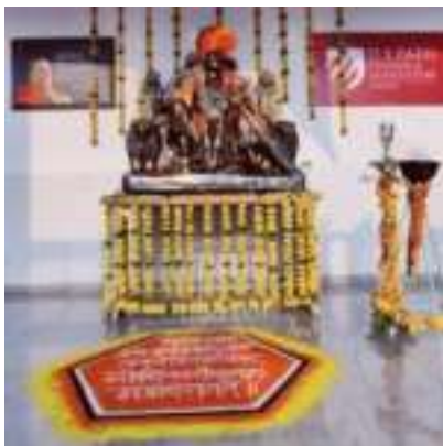
Decoration done by students for Chhatrapati Shivaji Maharaj Jayanti