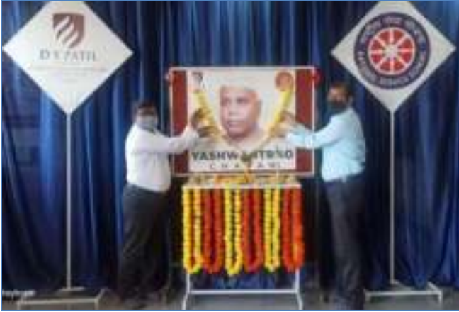
Principal, Academic In Charge greeting the image of Shri. Yashvantravji Chavan