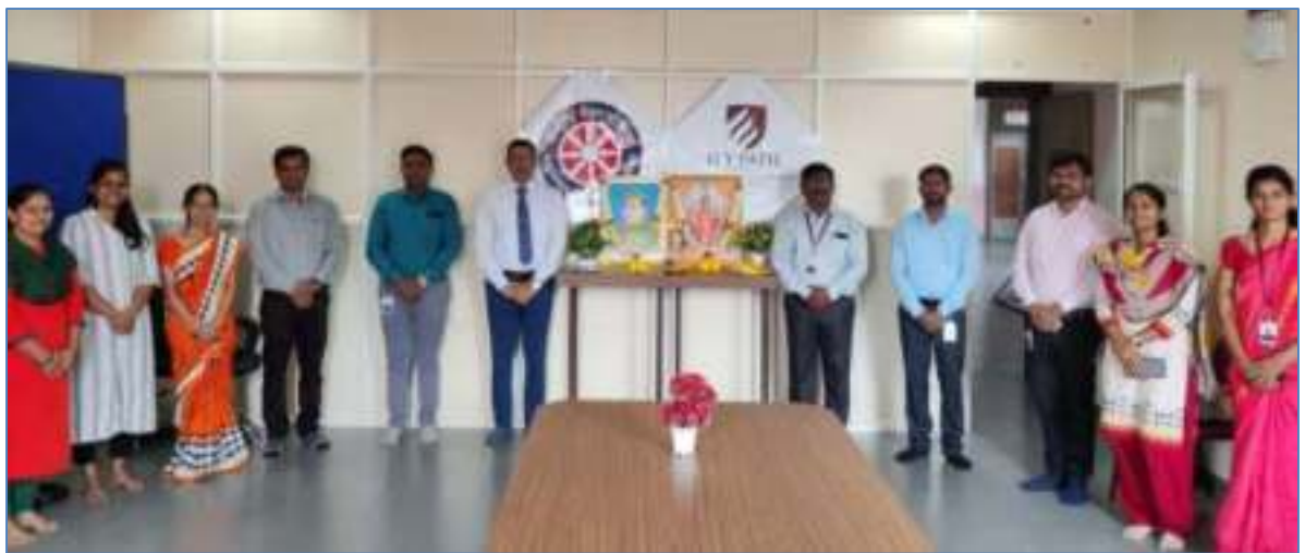
Principal, Academic In Charge, NSS Program Officer & Faculty present for the Celebration of ' Balasaheb Thackeray ' and ' Subhash Chandra Bose ' Jayanti