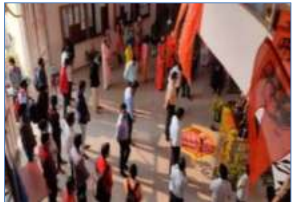
Students, Teaching & Non Teaching staff for Celebration of Chhatrapati Shivaji Maharaj Jayanti