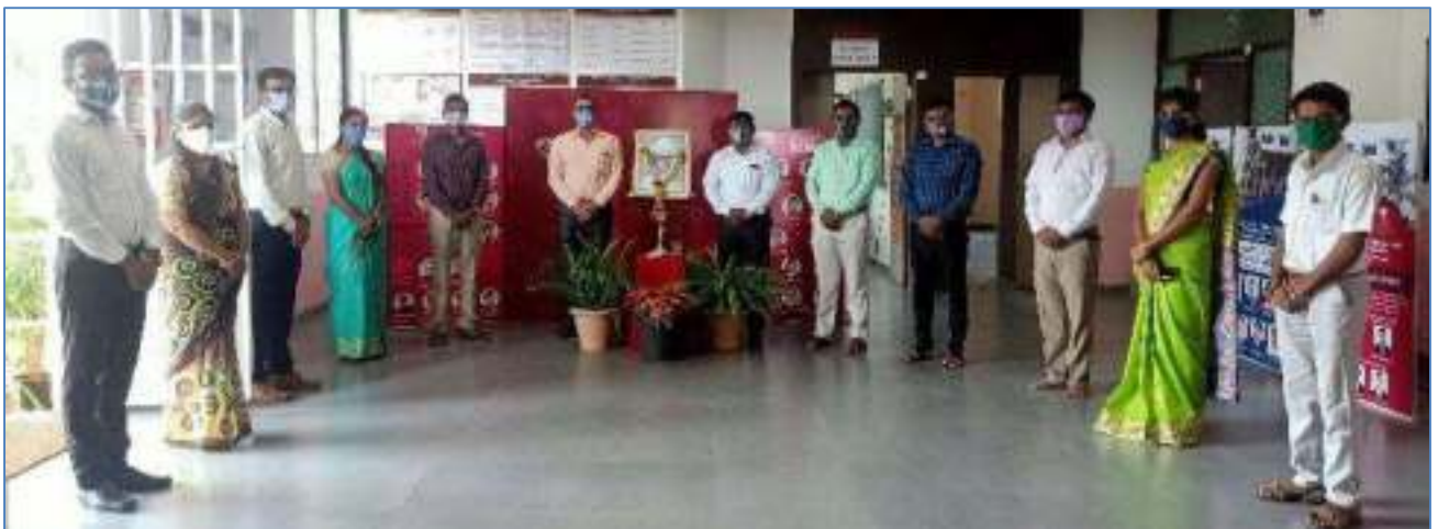
Principal, Academic I/C & Faculty on the occasion of Teachers Day