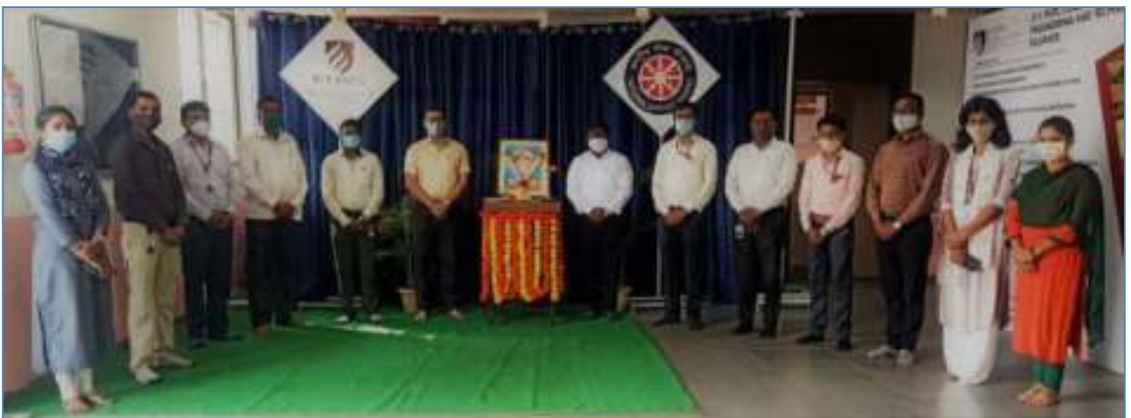
faculty of DYP CAET, Talsande on the occasion of Celebration of Sant Gadge Maharaj Jayanti