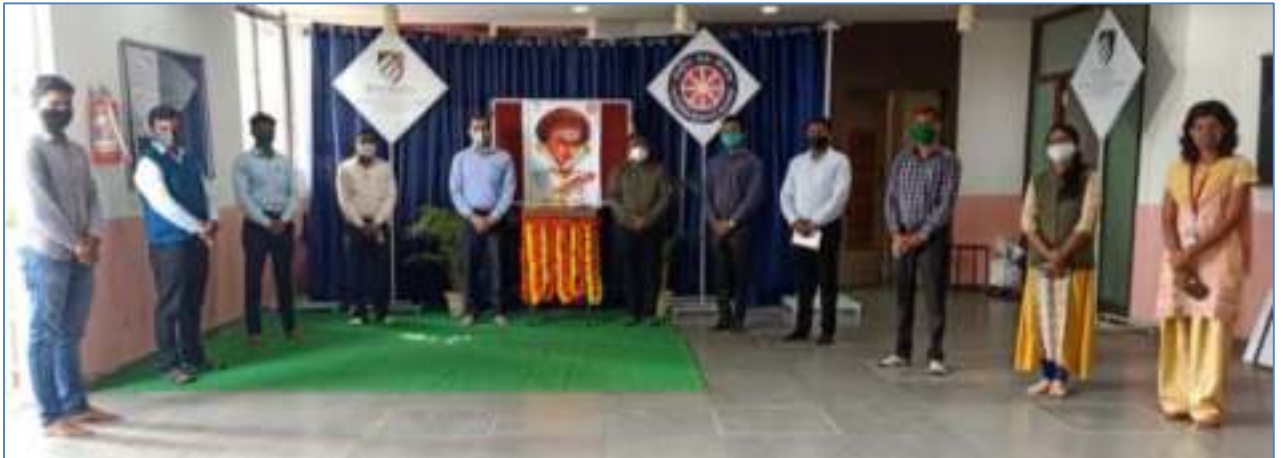
Students & Faculty for the Celebration of Balshastri Jambhekar Jayanti