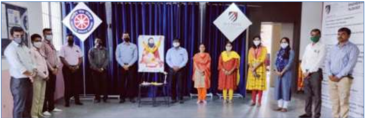
Teaching staff of DYP CAET, Talsande on the occasion of Celebration of Sant Ravidas Maharaj Jayanti