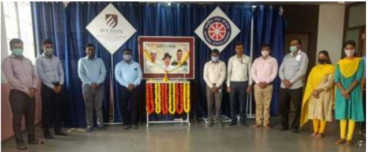
Academic In Charge, NSS Program Officer, Teaching & Non teaching staff of DYP CAET, Talsande paying a 02 minutes silent tribute towards the scarification of our great freedom fighters.