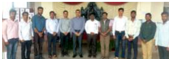
Students selected in Evergreen Mrudula pvt. Ltd., with staff