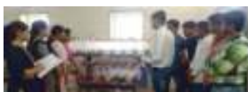
ALE-HORT-486 Vegetable production NRC Cashewnut - Vengurla & RCRS Bhatye