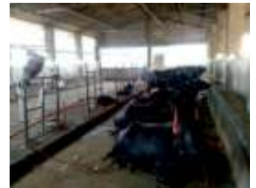
Buffaloes under conventional housing system Dr. D. Y. Patil Agricultural campus, Talsande.