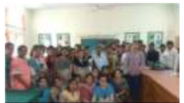
Visit to Department of Entomology, AC, Kolhapur