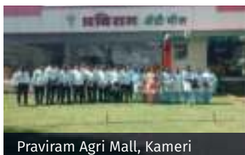
Praviram Agri Mall, Kameri