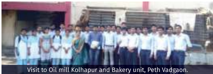
Visit to Oil mill Kolhapur and Bakery unit, Peth Vadgaon.