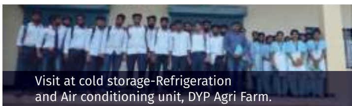
Visit at cold storage-Refrigeration and Air conditioning unit, DYP Agri Farm.