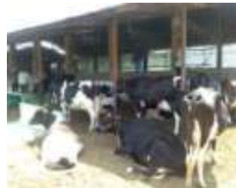
Cattle rearing under loose housing system, Dr. D. Y. Patil Agricultural campus, Talsande.