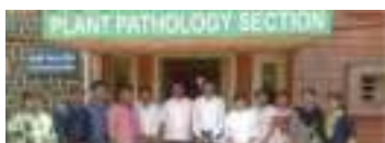
ALE-PATH-487 Bio fertilizer production College of Agriculture, Kolhapur - Bio fertilizer Unit