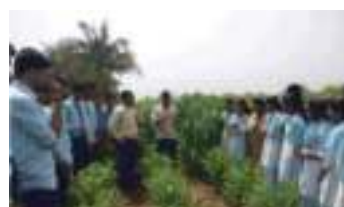
Visit to Sericulture unit, Yalgud. Dist.-Kolhapur