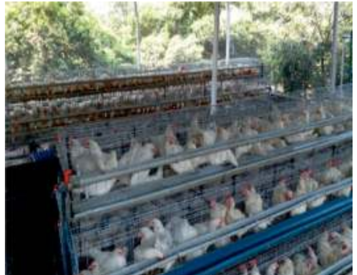
Poultry rearing unit, Dr. D. Y. Patil Agricultural Campus, Talsande.