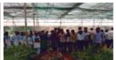
Visit to Shailesh Nursery, Shahuwadi-Malakapur.