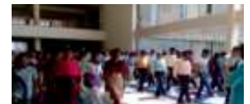
Staff along with the Students Practising Yoga & Meditation