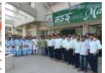
Visit to small processing unit-"Mandai Tumachi Amachi, Kolhapur"