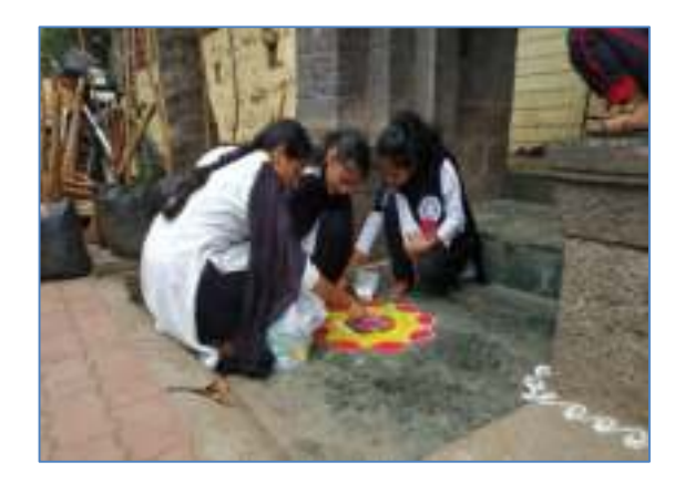
3. Painting of Katta & Rangoli at Hanuman Temple