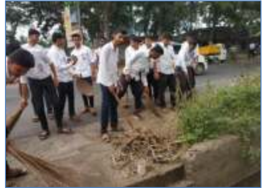
1. Cleaning of Roads, Bridge, etc.