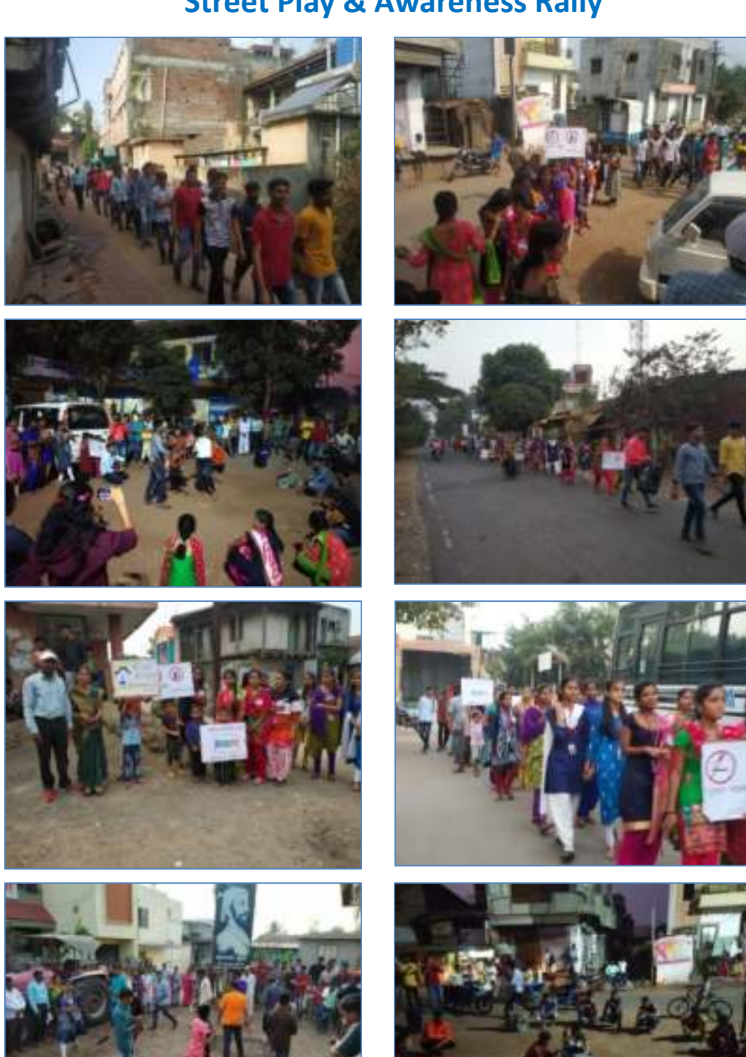
NSS volunteers are actively participated in all the campaigning program in the village every day. Rallies & Street Plays organized to create an awareness about tree plantation, Road safety, water purification, Tobacco & alcohol addiction, Pollution, Clean India-Healthy India. etc.