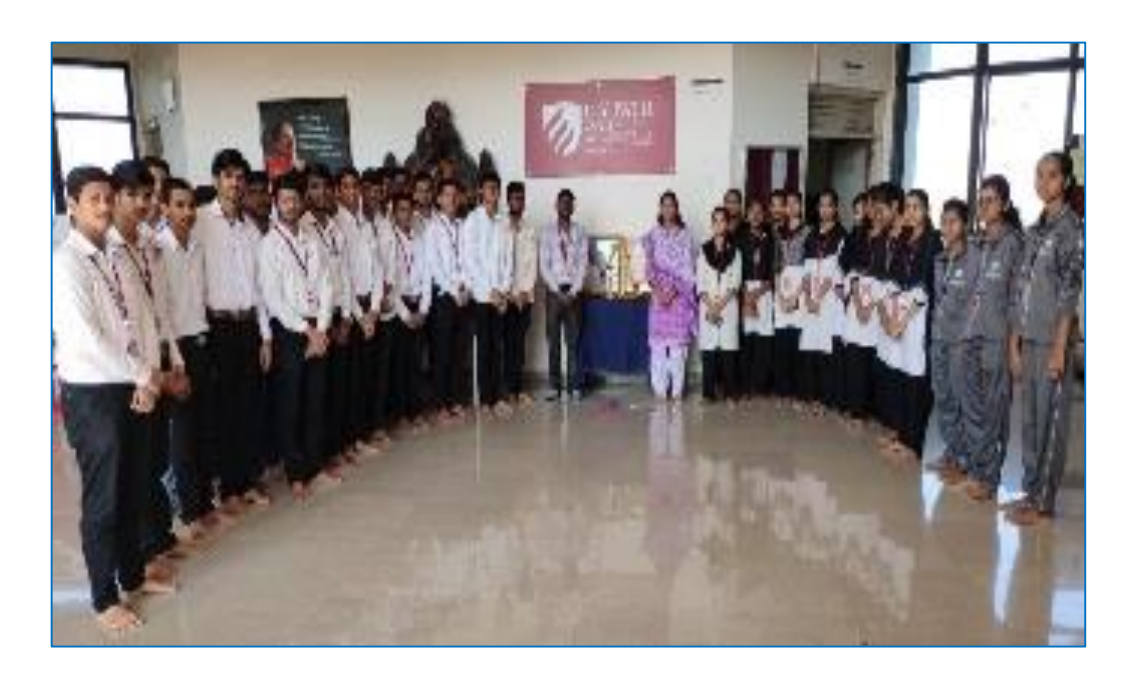
NSS Coordinator and NSS Volunteers