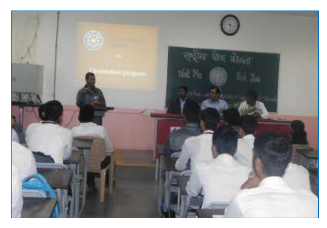
Senior NSS Volunteer sharing experience of NSS with newly admitted students