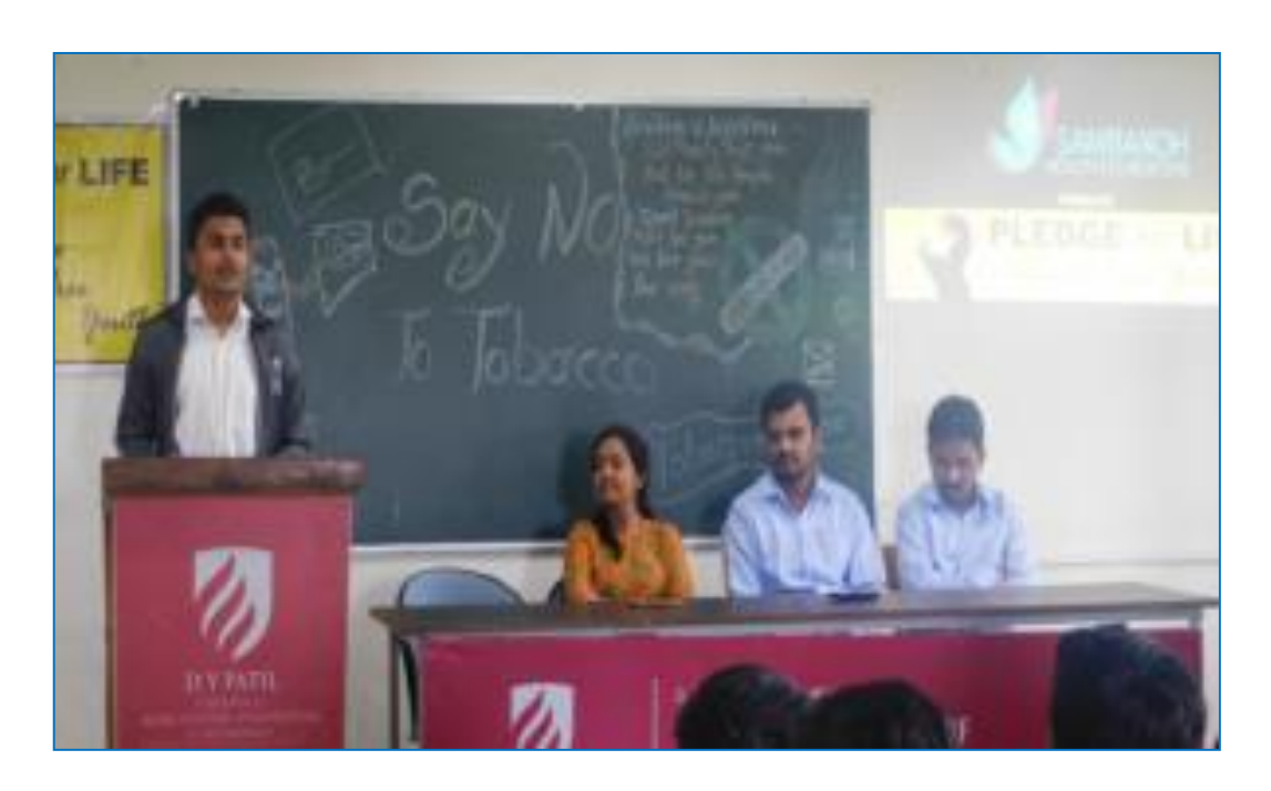
Student expressing his view on need of healthiness in students life.