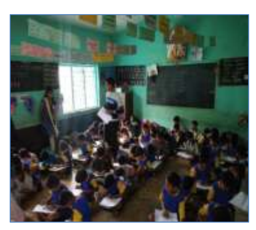
Various competitions for School Students were arranged. All children's participated and enjoyed the competitions such as Debate, Essay writing, Rangoli, Drawing etc.