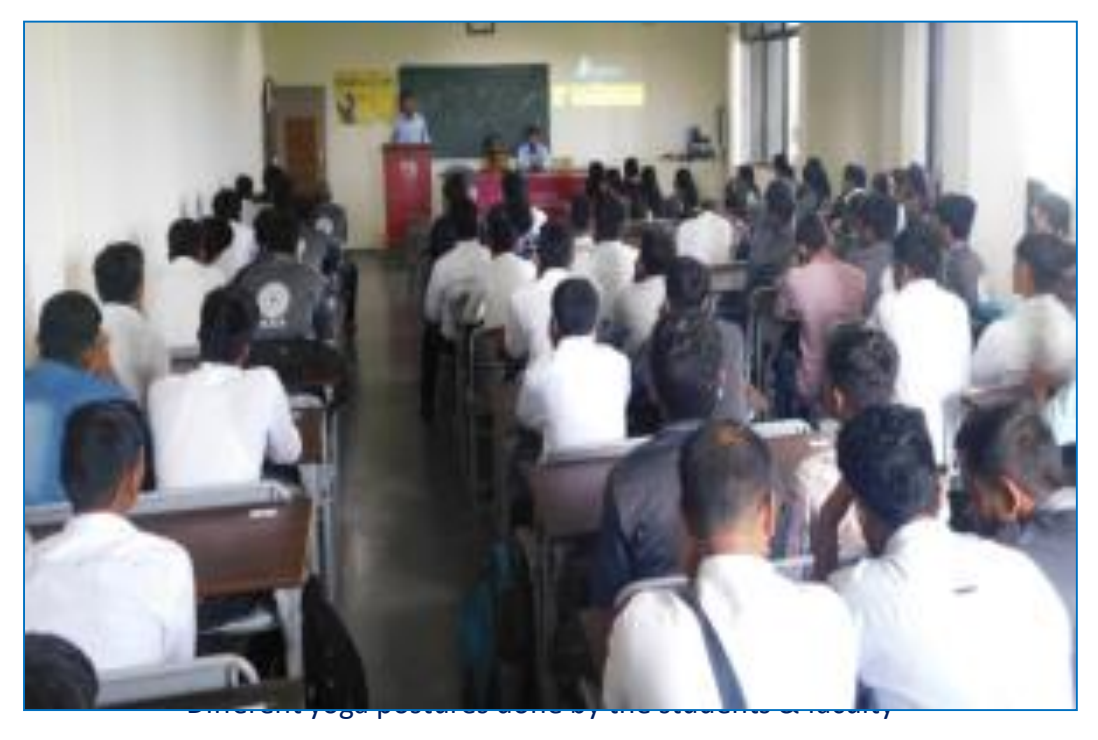
No Tobacco Day celebrated by taking oath and creating awareness among all students & staff