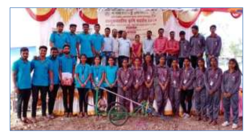
4. Participating in Agril. Exhibition, Aalate organized by Government Agriculture Department, Hatkanangale.