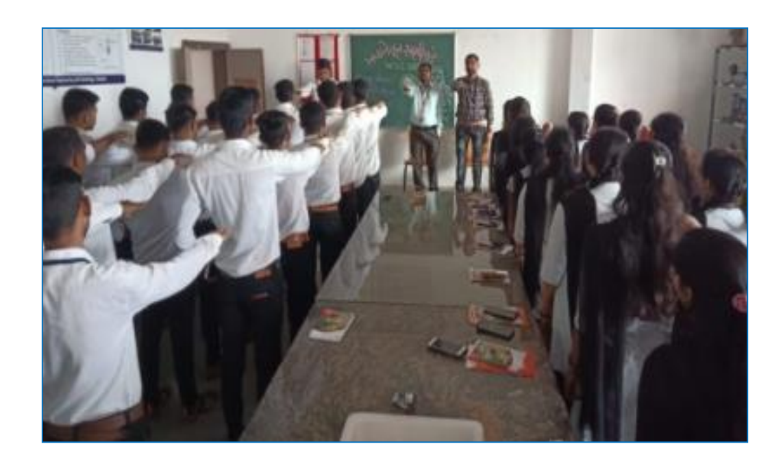
The oath of Cleanliness taken by the students.