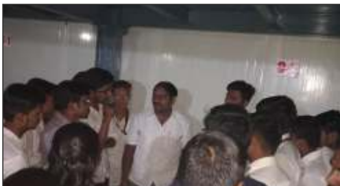
Visit to Revansiddh Cold storage, Tasgaon