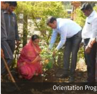
Orientation Programme at Latwade