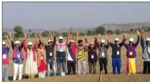
Visit to Watershed, Jakhale