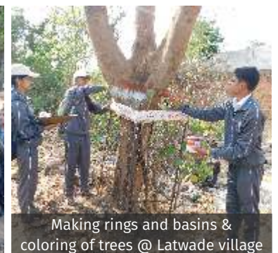
Making rings and basins & coloring of trees @ Latwade village