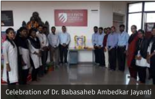
Celebration of Dr. Babasaheb Ambedkar Jayanti