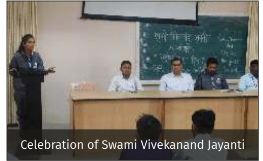
Celebration of Swami Vivekanand Jayanti