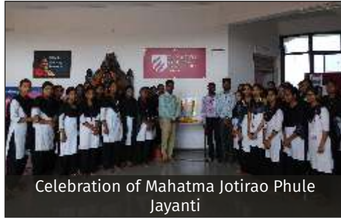
Celebration of Mahatma Jotirao Phule Jayanti