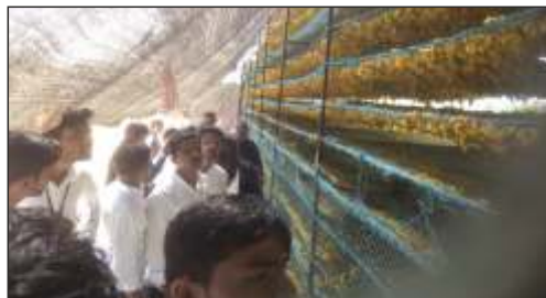
Visit to Raisains making farm, Arawad, Kagal