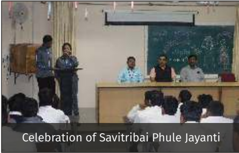
Celebration of Savitribai Phule Jayanti