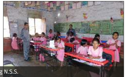
Students carried out various types of activities during N.S.S.