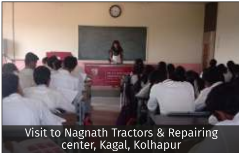
Visit to Nagnath Tractors & Repairing center, Kagal, Kolhapur

Topic – Important tricks to score in Heat & Mass Transfer