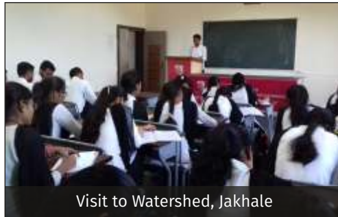
Visit to Watershed, Jakhale

Topic – My experiences & techniques in studying Building Materials