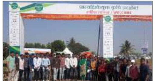
2 nd & 3 rd Year students of B. Tech. (Agril. Engg.) Visited Krushak-2019 India's Biggest Live Demo & Agri. Expo. at Baramati.