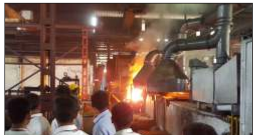
Visit to Kasturi Foundry, Ashta, Sangli