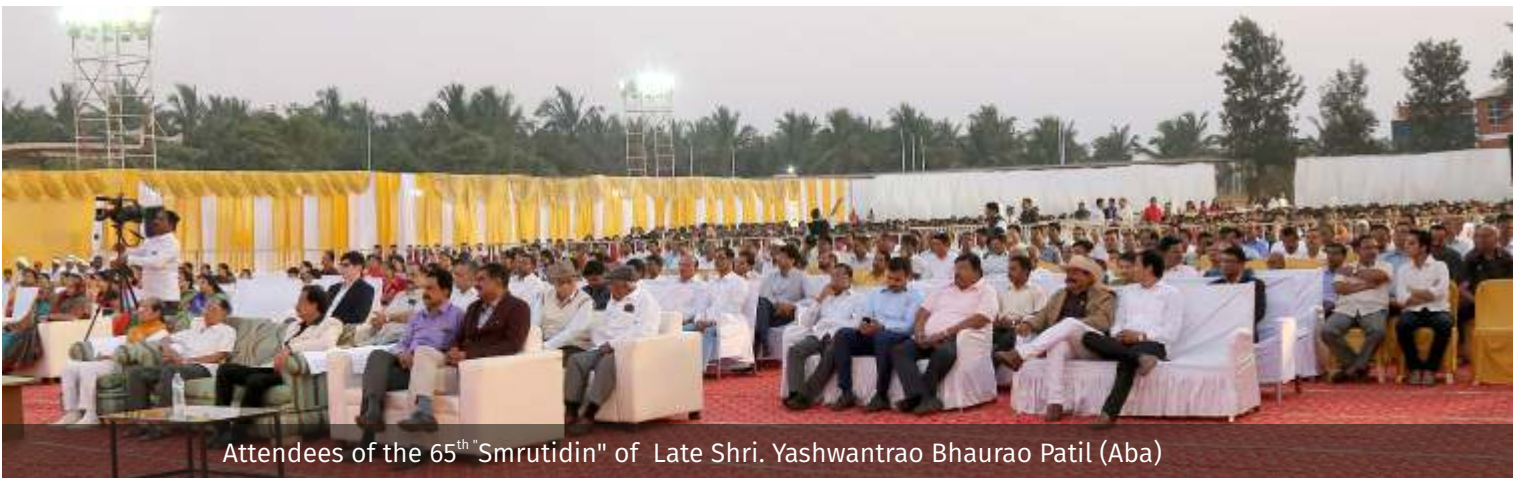
Attendees of the 65 th "Smrutidin" of Late Shri. Yashwantrao Bhaurao Patil (Aba)