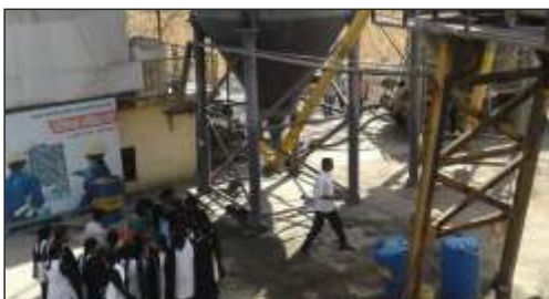
Visit to ISM Ready Mix Concrete Plant, Patil Stone Crusher Plant & Construction Site