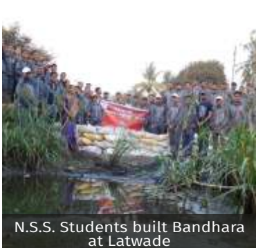
N.S.S. Students built Bandhara at Latwade