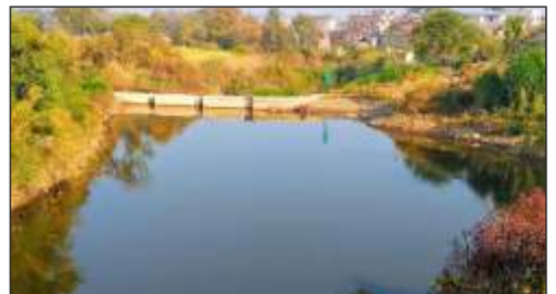
SWC Measures seen