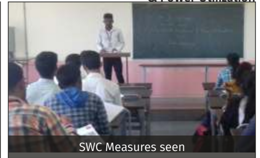
SWC Measures seen

Topic – How to score in Electrical Machines & Power Utilization