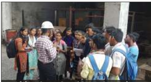
Visit to Steam Based Power Generation Plant, Warana Sugar Factory, Warananagar