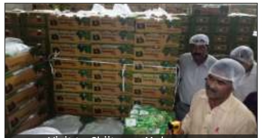
Visit to Chitanya Mahagrapes, Packahouse Unit, Palus, Sangli