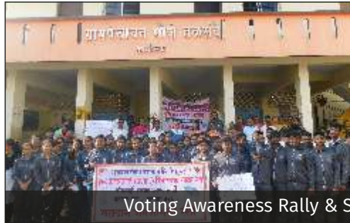
Voting Awareness Rally & Street Play by N.S. S. Students