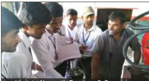
Visit to Nagnath Tractors & Repairing center, Kagal, Kolhapur