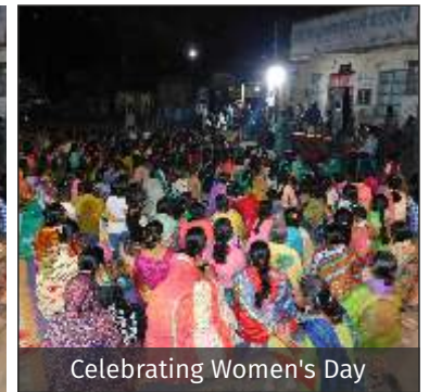
Celebrating Women's Day