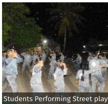
Students Performing Street play