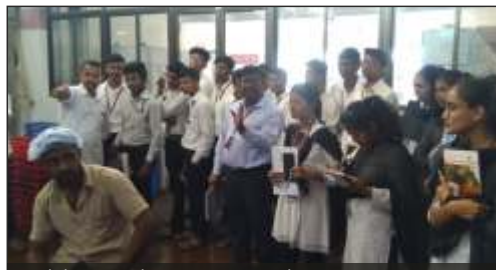
Visit to Shri. Chh. Shahu Milk & Agro Produces Company Ltd., Kagal, Kolhapur